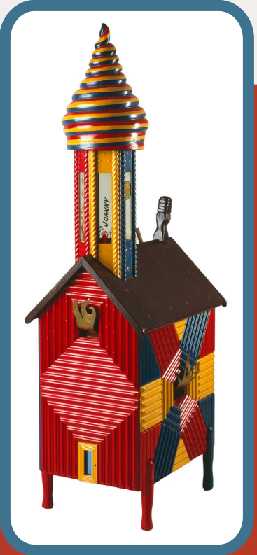
H. C. Westermann, Burning House , 1958 Pine, brass bell, tin, glass, rope, and enamel 2008.13.1

H. C. Westermann was a part of the Chicago Imagist group of artists.