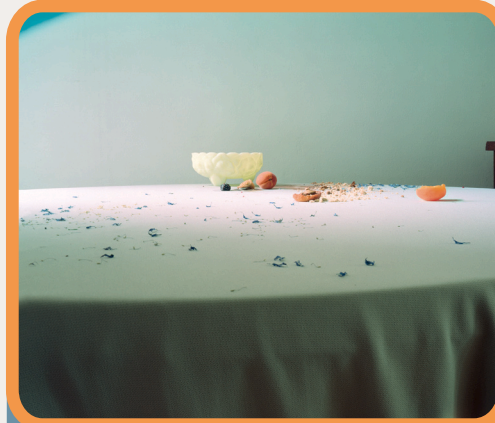
Laura Letinsky, Untitled # 80 2003, Chromogenic print archivally mounted to Sintra, 2006.6

Contemporary artists use many different kinds of media (materials) to create their artworks including painting, video, photography, sculpture, printmaking, and drawing.