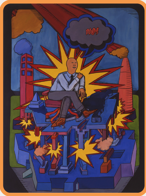
Art Green, Consider the Options, Examine the Facts, Apply the Logic , 1966, Oil on canvas 1996.60

Take a look at the paintings on the light blue wall in this gallery.